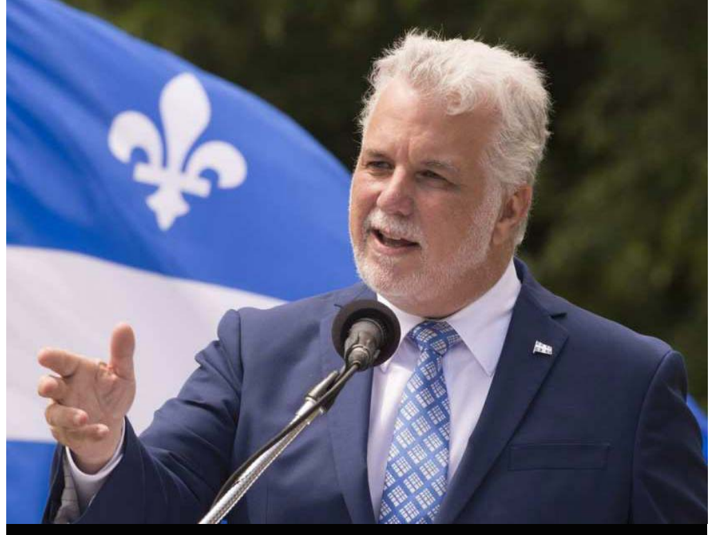
Language issues have popped up at the Liberal youth convention with a clutch of Montreal Liberals proposing to loosen up the French Language Charter and allow francophones into the English system.

Published on: August 14, 2017 | Last Updated: August 14, 2017 8:23 AM EDT