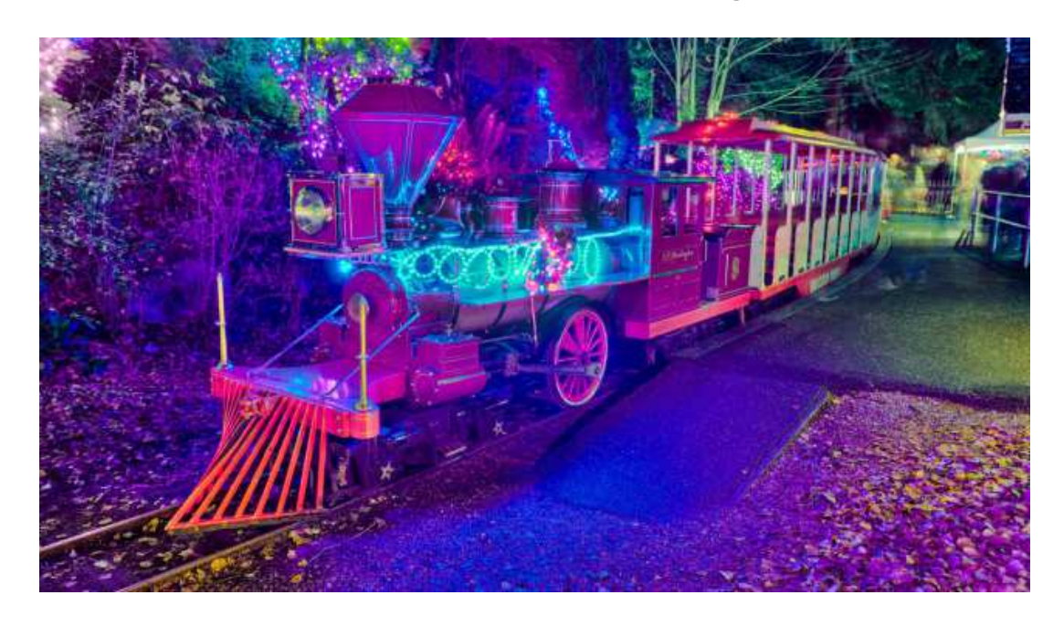
Bright Nights Christmas Train in Stanley Park

This train ride includes cookies and hot chocolate (just like the movie!) a visit by the hobo, entertainment, singing and a magical-40 minute ride to the North Pole. The visit at Santa's Village features crafts, Christmasthemed model railroads, Santa and Mrs. Claus and much more. • West Coast Railway Heritage Park, 39645 Government Rd., Squamish • Saturdays and Sundays until Dec. 17, various departure times • Coach Class/$30, First Class/$45, 604-898-9339, wcra.org