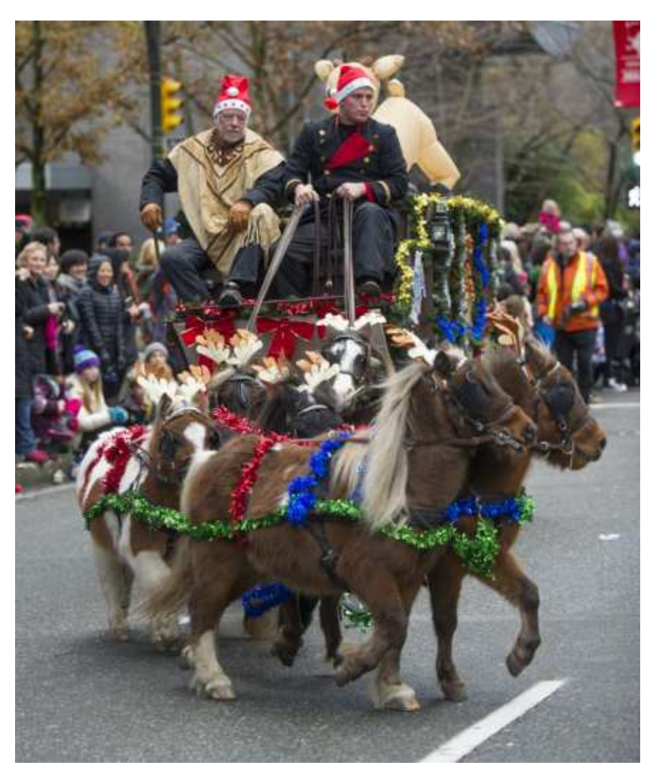
13th Annual Rogers Santa Claus Parade This annual parade features marching bands, choirs, festive floats, community groups, and of course, the big man himself – Santa! Please bring a cash or food donation for the the Greater Vancouver Food Bank

by the official lighting of the City's Christmas tree. • Shipbuilders' Square, Wallace Mews Rd., North Van • Dec. 3, 5-8 p.m. • Free, vancouversnorthshore.com/events/north-vancouver-christmas-festival